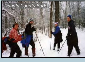
Donald County Park

Several parks include segments of the extensive Dane County snowmobile trail system . Excellent snowshoe opportunities can be found at Donald, Festge, Stewart Lake, CamRock, and Token Creek County Parks. Snowshoeing is allowed on all trails not designated as groomed cross-country ski trails. For information on seasonal trail conditions, contact the Dane County Parks information line at 608-242-4576 or visit www.countyofdane.com/lwrd/parks .