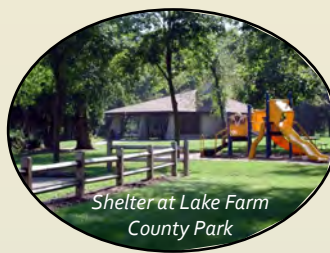
Shelter at Lake Farm County Park

Picnic sites are available at most Dane County Parks. The park system includes more than 30 picnic shelters that may be reserved for exclusive use for family get-togethers, meetings, and other events. Shelter facilities range from modern sites that accommodate very large groups to rustic, smaller shelters perfect for family picnics. The rustic timber-frame shelter at Scheidegger County Forest in the Town of Verona was constructed in 2010 entirely of wood harvested from the property. A rustic shelter at Donald County Park in the Town of Springdale is also a popular destination for family events and gatherings. For information on fee schedules and availability of all shelters, visit www.reservedane.com or contact the Dane County Parks office at 608-224-3730.