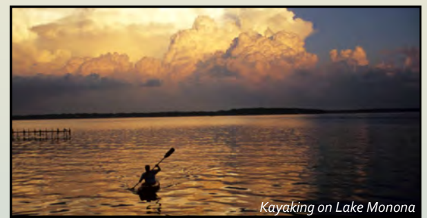
Kayaking on Lake Monona

Dane County has an abundance of lakes, streams, and rivers that offer a variety of paddling adventures. Access to some of the water trails identified on this brochure is limited to public road right-of-ways at bridge crossings. Please respect private property and remember that the waterways are public, but the adjacent lands, in most instances, are private. More information on paddling opportunities in Dane County can be found at www.capitolwatertrails.org and www.danewaters.com (search on Water Trails).