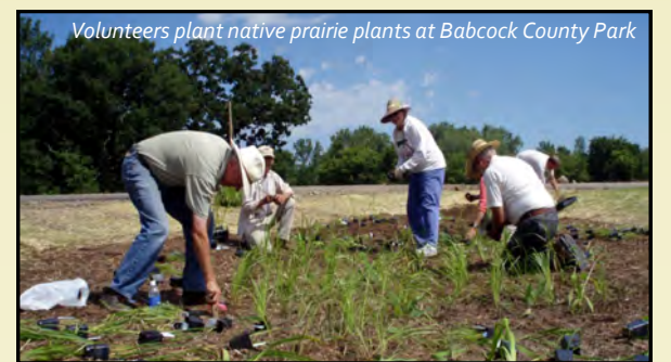
Volunteers plant native prairie plants at Babcock County Park

Volunteer opportunities are available for individuals or school, church, community, corporate, or “Friends of the Park” groups. The program provides volunteers with an outstanding opportunity to better understand the Dane County Parks system at a grass-roots level. Past volunteer accomplishments include poetry trail development; invasive vegetative species removal; prescribed burns; prairie seed collecting, cleaning, and planting; park research; fund raising; trail clearing and stewardship; and tree planting. For information on how you can get involved, please contact the Dane County Parks Volunteer Coordinator at 608-224-3601 or visit www.countyofdane.com/lwrd/parks/volunteer .