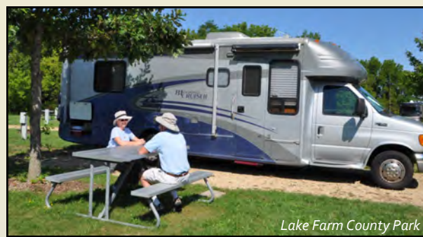
Lake Farm County Park

Babcock, Brigham, Lake Farm, Mendota, and Token Creek County Parks all offer designated campgrounds. Campsites are available on a first-come first-served basis or by reservation. Campsites must be reserved at least 5 days prior to the initial camping date and can be made online at www.reservedane.com . Campers must register and pay the camping fee prior to setting up. Group camping by reservation is available at Brigham, Indian Lake (youth), Lake Farm, McCarthy, and Token Creek County Parks and Scheidegger Forest. Contact Dane County Parks at 608-224-3730 or visit www.countyofdane.com/lwrd/parks for complete campground reservation information and regulations.