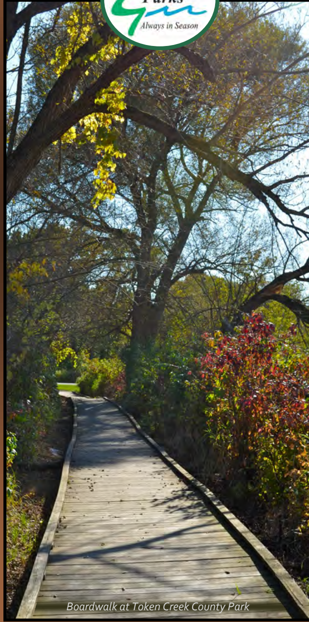
Boardwalk at Token Creek County Park